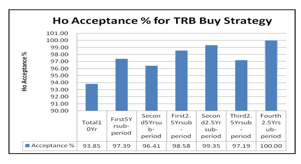
Fig1. Graphical sub-period Weekly TRB Buy Strategy test results

In case of TRB Buy strategy for all seven sub-periods the null hypothesis of weak form of market efficiency is accepted. The acceptance % is observed to be lowest in case of total 10 year period.