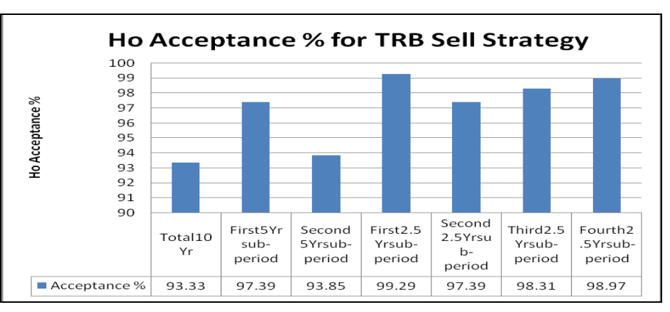
Fig2. Graphical sub-period Weekly TRB Sell Strategy test results