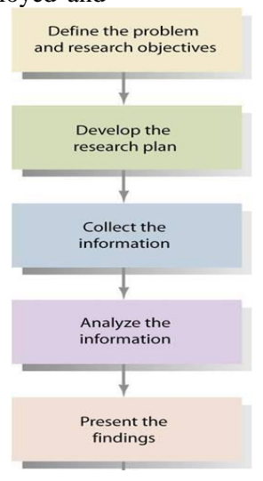
Fig2. Finding of relative problems process

More specifically, the limited general theory which does pertain to working capital management like capital budgeting emanates from the finance literature and focuses on the relationship between risk and profitability by define and finding of relative problems as Figure 2.