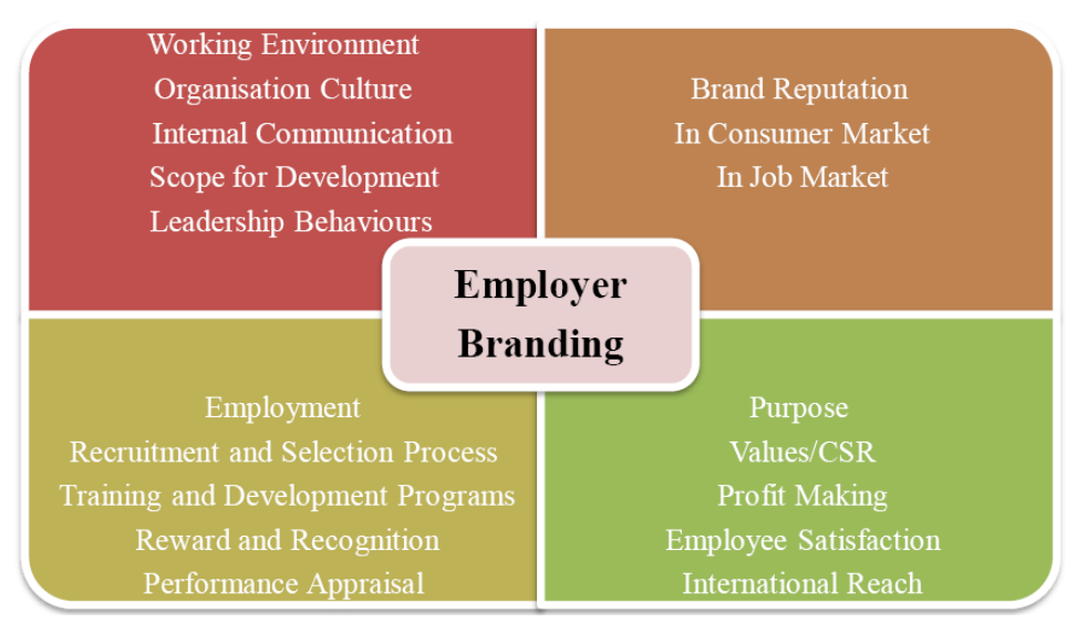
Figure 2. Effective Employer Branding